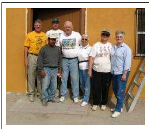
Members of Faith Lutheran Hot Springs Village, Arkansas - Partners with San Mateo Lutheran Church, San Luis Rio Colorado, Son.

KIMA encourages congregations to become "partner or sister congregations" with individual congregations of the Lutheran Synod of Mexico enriching them, supporting them with prayers, finances, and personal visits. A "partner or sister" congregation would take the lead in seeing to it that the needed assistance is made available. This could include: