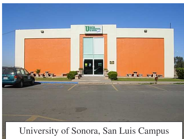
University of Sonora, San Luis Campus