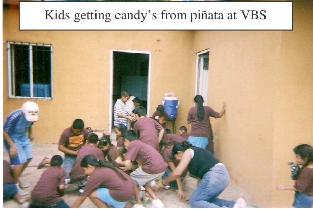
Kids getting candy's from piñata at VBS

It was something beautiful to be able to have shared the love of God and His dear Son to all these children. The last day of classes, we had a small celebration in the children's company and adults. We enjoyed a piñata and candies. It was a great blessing.