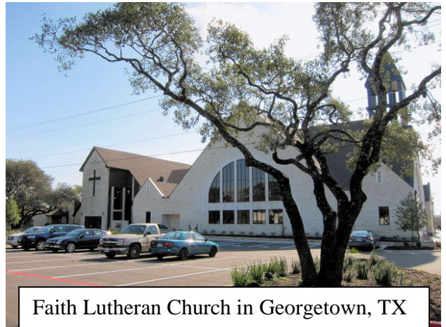
Faith Lutheran Church in Georgetown, TX

So we have the challenge. We are to go and make disciples. The nation right to our south has many people who have not received Jesus in their heart. These are troubling times in Mexico. But God has put special people in place who are willing to step forward, lead, organize, teach, set up tents, play musical instruments, keep vehicles running, and provide electrical power - all to share the Gospel message through all their activities.