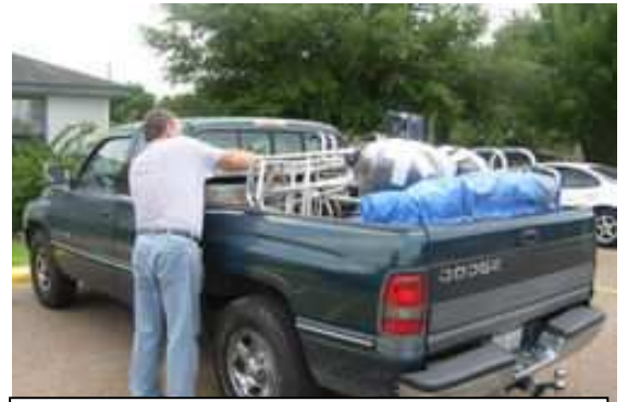
A truck loaded with medical supplies.

4 For as in one body we have many members, and the members do not all have the same function, 5 so we, though many, are one body in Christ,