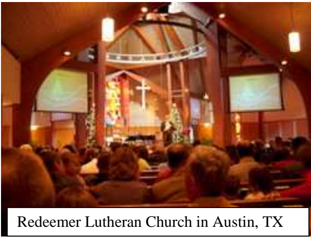
Redeemer Lutheran Church in Austin, TX