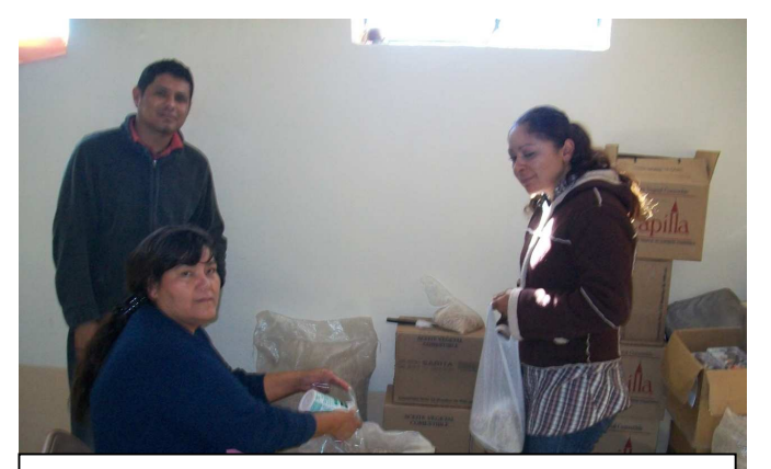
Ladies packing beans and rice, help received from Faith Lutheran Church, Hot Springs, Arkansas. Thanks to you.