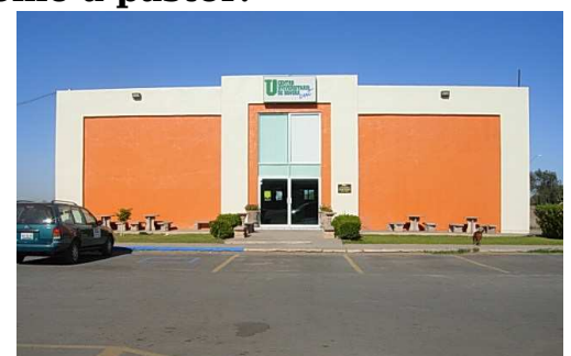
Centro Universitario de Sonora,