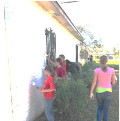
Painters at El Calvario in Brownsville, Texas

❖ Administrative costs which included computer repairs, postage stamps, and banking account analysis fees totaled another $203.65. This leaves us with a bank balance of $8,349.49.