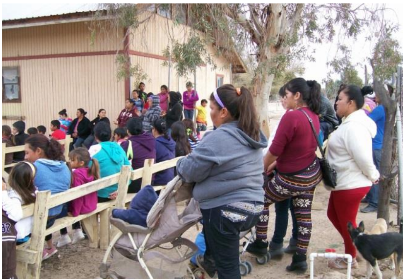
Santo Tomas Misión, Mesa Rica A walk into the desert

At the time of Jesus' resurrection He told His disciples that they were to go back up to Galilee and He would meet them there. In Matthew 28:19-20, Jesus came to His disciples and said, "Go and make disciples ...baptizing ...and teaching. And surely I am with you always, to the very end of the age."