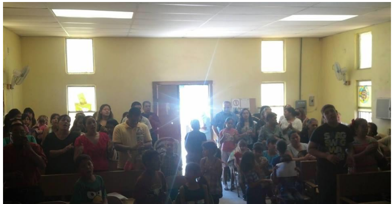
Sunday Worship at San Mateo Evangelical Lutheran Church.