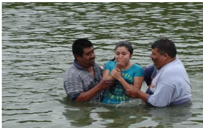
Baptism in the Rio Grande River

The Great Commission won’t go away until the LORD decides that now is the time for us all to come home. Until that moment His directive is still there, “Go...make disciples...baptize ...teach them everything I have commanded you,” and His promise hasn’t changed either, “I will be with you always, to the end of the age.”