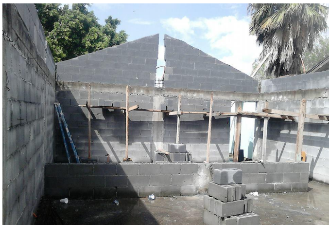
Expansion at Mesias Mission near Rio Bravo

Because of God’s plans for His people, KIMA’s mission hasn’t changed either. KIMA is an agency of like-minded, Spirit-led, individuals and congregations seeking opportunities to assist other individuals, congregations, and the Lutheran Church/Missouri Synod in extending and strengthening the Lord's Kingdom among Hispanics and Mexicans, locally, along our southern border, and into Mexico.