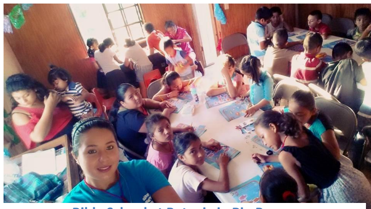
Bible School at Betania in Rio Bravo

I would like to ask that you include KIMA in your prayers along with its mission of reaching out to assist our brothers and sisters in Christ in Mexico as they continue to be a vital part of the Body of Christ. If the Lord has blessed you in such a way as you are able, I would ask for any financial