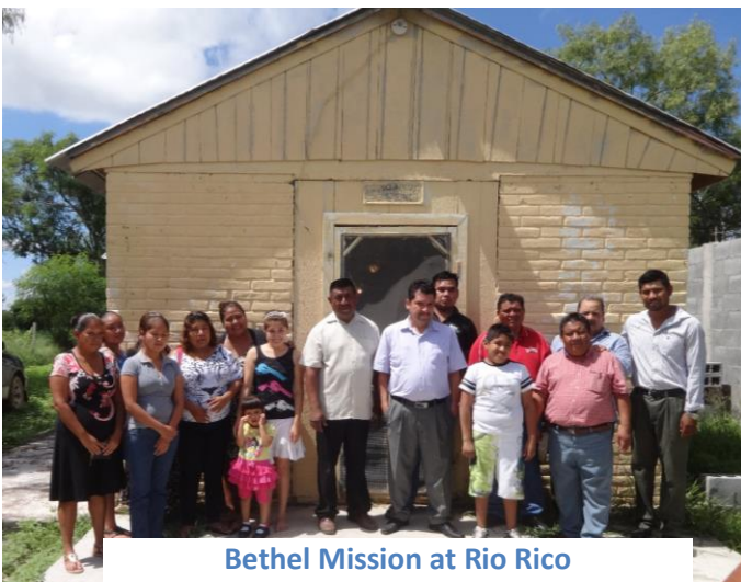
Bethel Mission at Rio Rico

The Lord has moved you along His path and things keep changing. Throughout this though, the one thing that hasn't changed is the fact that our God still loves us and is still calling us to join Jesus on His mission of leading lost and troubled souls back to Him so that they can be received into His Kingdom forever.