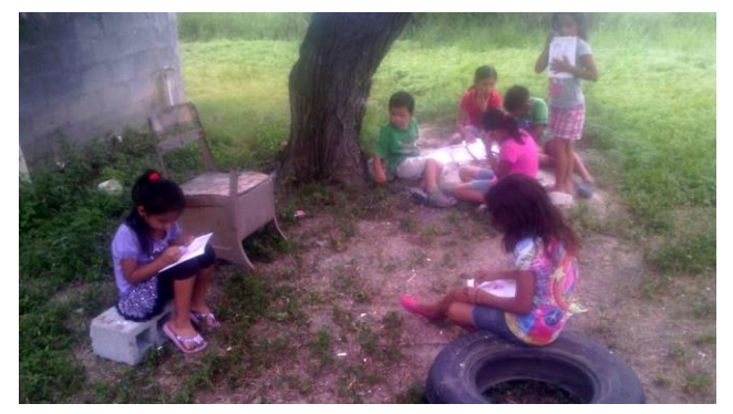
So I am looking for people who will volunteer to help us get either enough money or, better yet, enough toys for these forty children.

What a joy it would be to make a trip before Christmas and present them with an altar to worship on, a cross to be reminded of God's sacrifice, and presents to remind the children of the ultimate gift that God has provided for them!