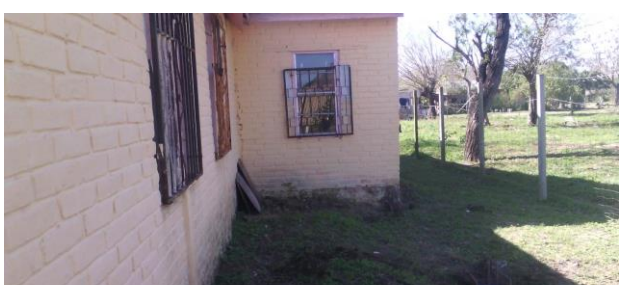
This is the wall that will be moved to the left to give more room in the sanctuary.

pouring concrete pillars and floors, building cement block walls, and now waiting for the rain to stop before they can start on the next step. They will be taking off the old roof adding a couple layers of cement block, in order to elevate the ceiling and roof, and putting a new roof over the whole