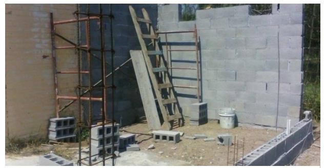
Back and side walls to the office area. The front wall will be where the cement blocks are being laid.