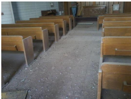
San Juan Lutheran Church, Mexicali