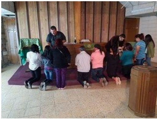
San Juan Lutheran Church, Mexicali

two churches. The decision to do so was easy, how to carry it out would be a much larger problem.