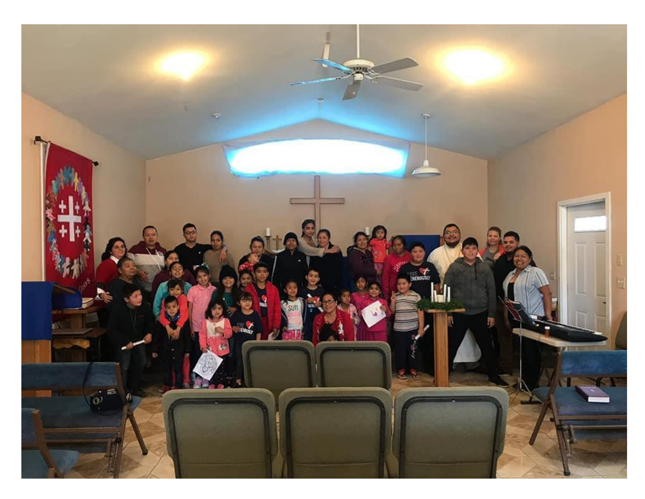
Last Sunday December 23.