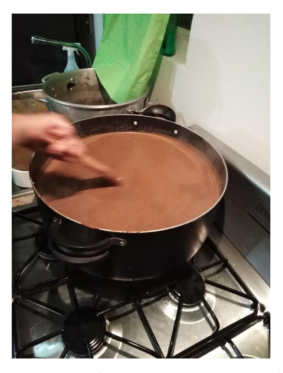
A rich mole on way for celebrate communion and reception of the Lutheran Church Cristo Redentor.