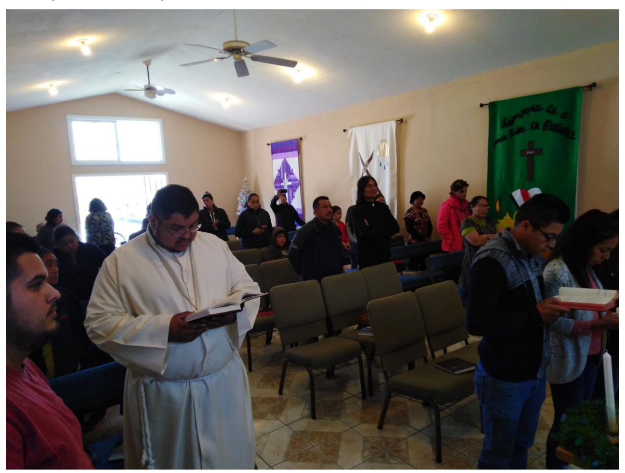
Sunday services on my install.