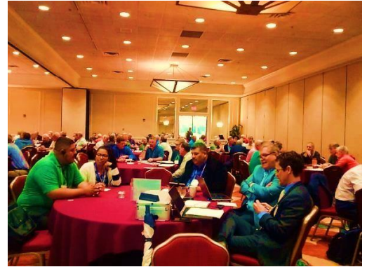
2019 Theological Convocation