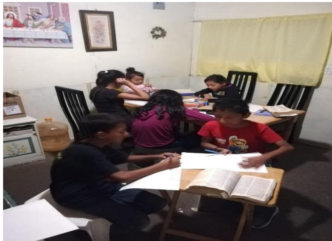
Kids at Catechism class by Diana.