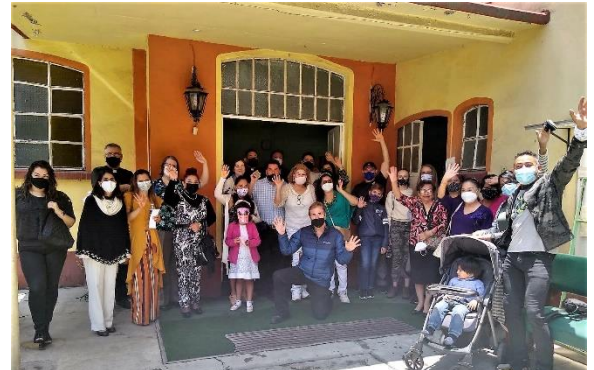
Front door of San Pablo in Mexico City