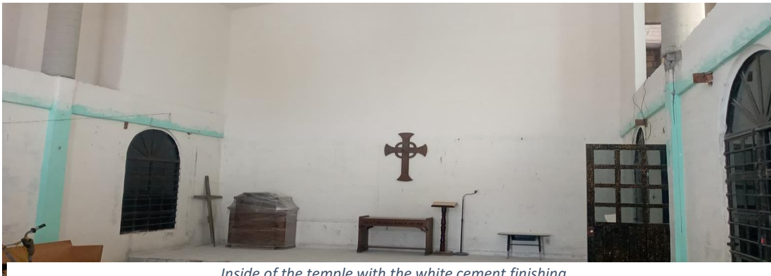
Inside of the temple with the white cement finishing

With the 3200 dollars that you sent, we have finished fencing the inside of the temple, the entrance and the office, that was what we managed to do with the money. The children's room and the outside and the façade have yet to be clad.