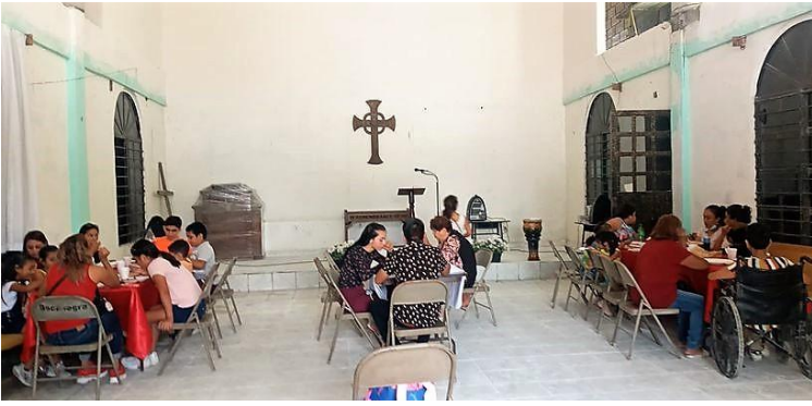
Saturday Bible Class for the children of the neighborhood