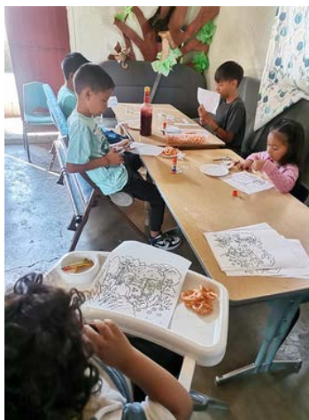
ONE YEAR AGO 4 KIDS COME FOR BIBLE CLASS

WE ALSO THANK GOD FOR THE TIME OF BIBLE CLASSES FOR CHILDREN IN OUR CHURCH. WE ARE HAPPY TO SHARE GOD'S BLESSINGS BY PROVIDING HIS WORD AND SOME NUTRITIOUS FOOD. CURRENTLY, WE DO NOT HAVE A BUDGET; WE TAKE FROM OUR FOOD PANTRY TO SHARE WITH THE CHILDREN AND YOHTHS; WE PRISE THE LORD BECAUSE THERE ARE ALMOST 25 CHILDREN AND YOUTHS COMING EVERY SATURDAY MORNING, WE ASK FOR YOUR PRAYERS TO GOD TO PROVIDE WHAT IS NECESSARY BECAUSE AT THE BEGINNING THERE WERE 5 CHILDREN BUT NOW IT IS MORE COMPLICATED TO SHARE 30 NUTRITIOUS MEALS. BUT WE ARE HAPPY BECAUSE GOD IS FAITHFUL, AND EVERY SATURDAY, HE MULTIPLIES THE FOOD WONDERFULLY AS HE MULTIPLIES THE FISH AND THE LOAVES!