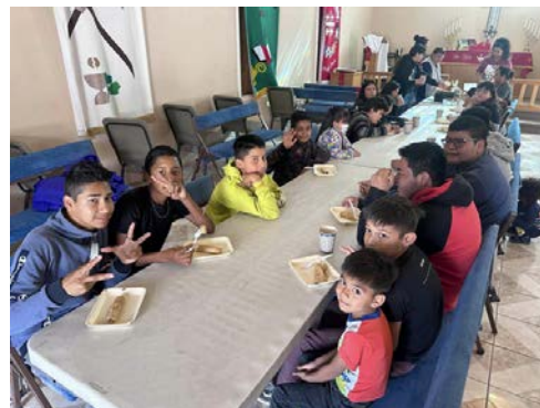
NOW MORE THAN 25 KIDS AND YOUTHS ARE COMING FOR BIBLE CLASS AND BREAKFAST.