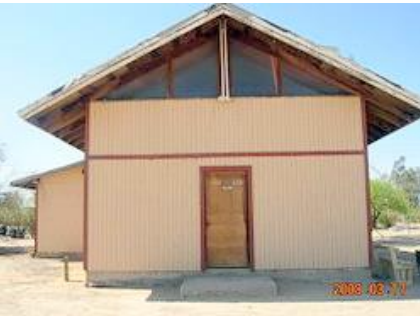
Santo Tomas Lutheran Mission at Mesa Rica