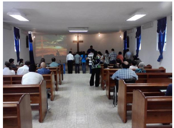
Santisima Trinidad Lutheran Church