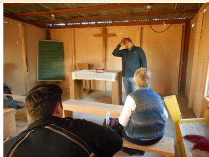
King of Glory Lutheran Mission at Independencia