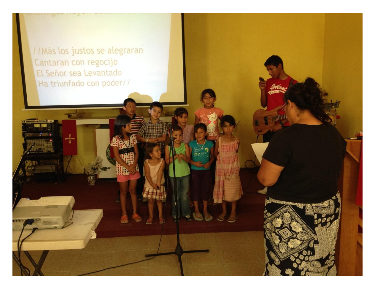
Some Kids playing at Pentecost Sunday Service.

"And whether one member suffer, all the members suffer with it; or one member be honoured, all the members rejoice with it.Now ye are the body of Christ, and members in particular." 1 Cor 12:26-27