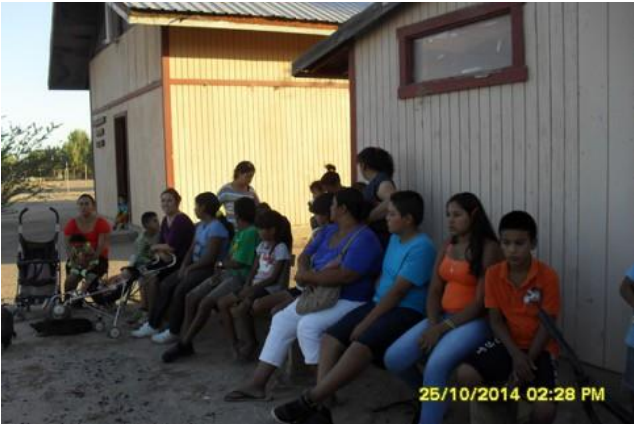
Santo Tomas Mission