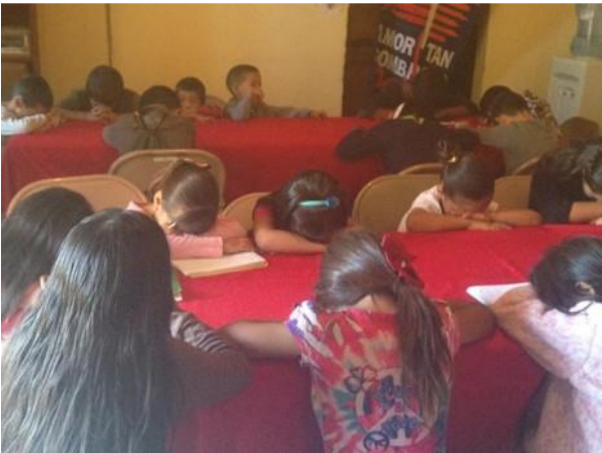
Kids at breakfast at San Mateo.