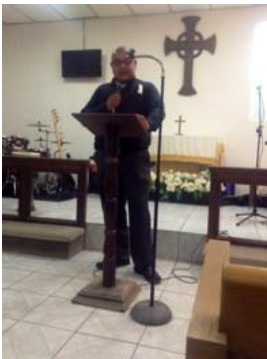
Preaching at Betania Lutheran Church