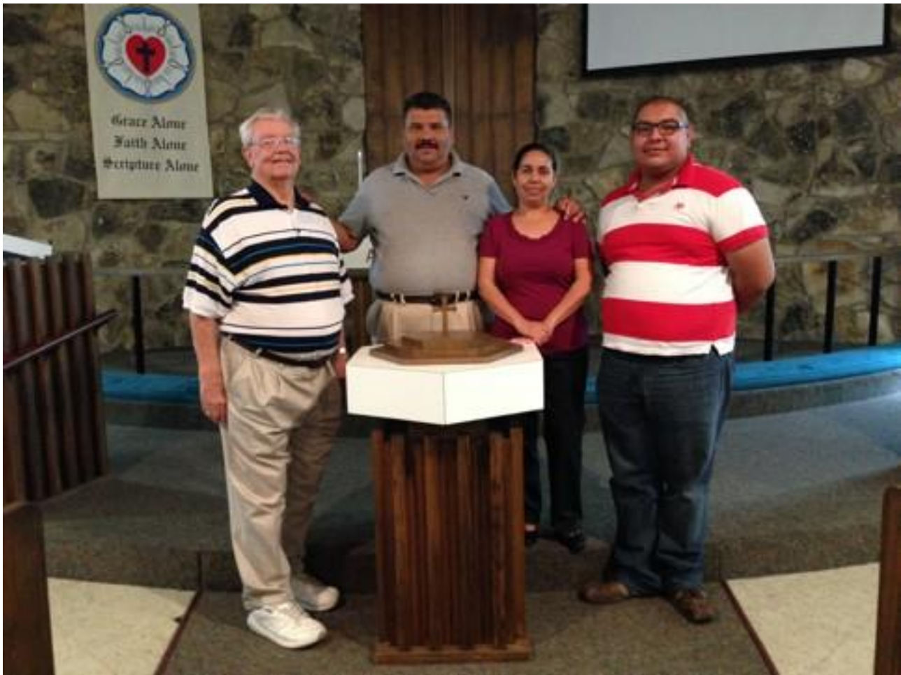
Christ the King Lutheran Church.