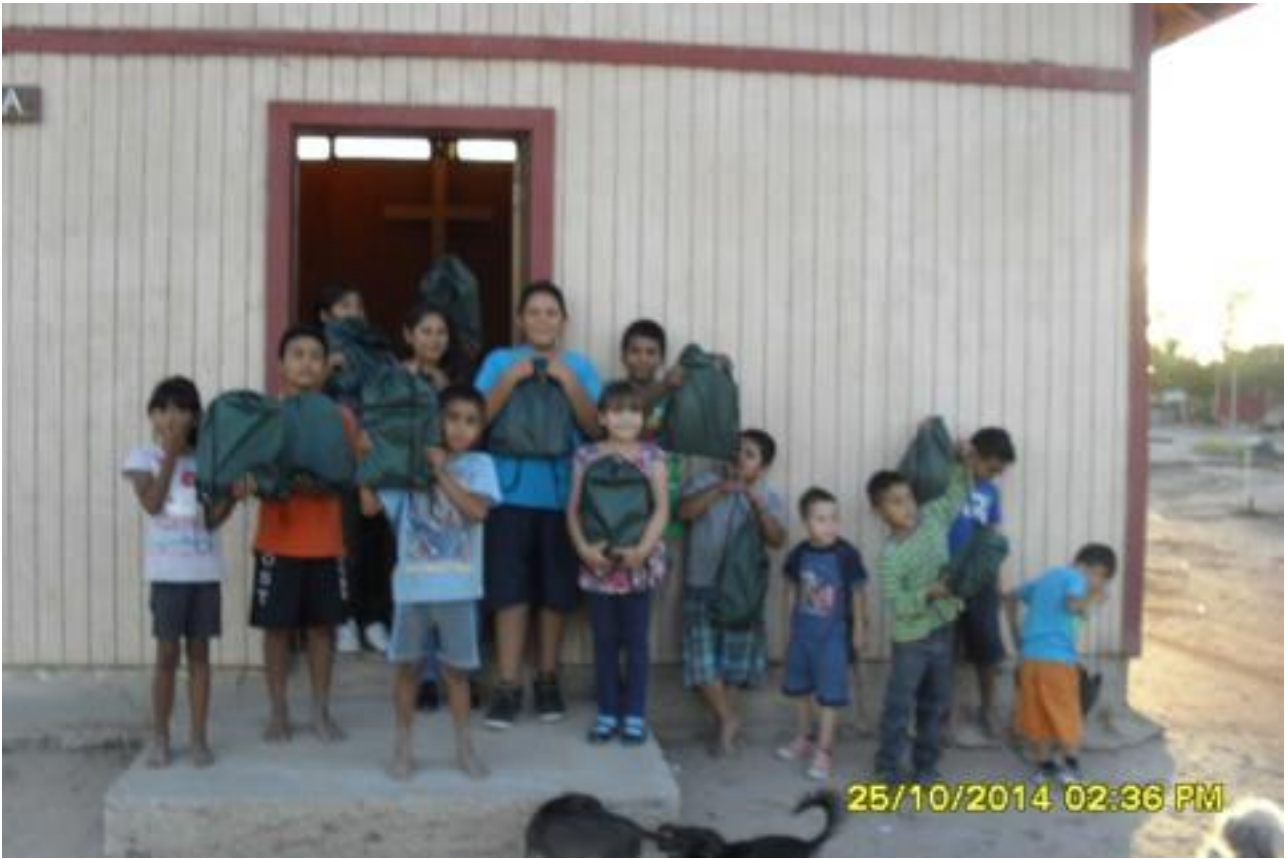
Kids with School Supplies. Thanks LBCM