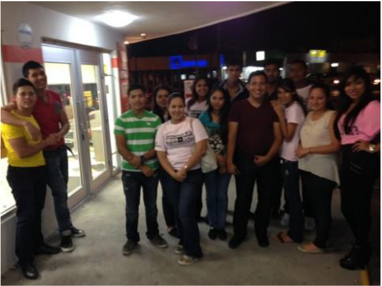
Sharing dinner with Youths from Betania Lutheran Church in Rio Bravo.