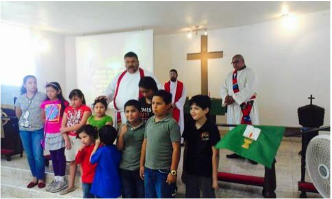
Worship with Communion at Holly Trinity (Santisima Trinidad) at Matamoros Mexico.